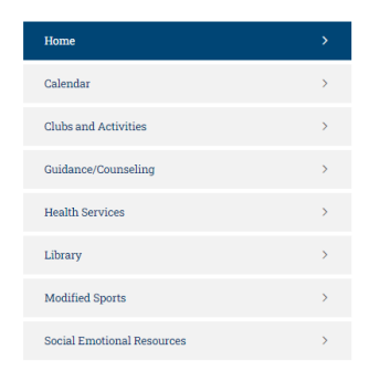
Homer Junior High School